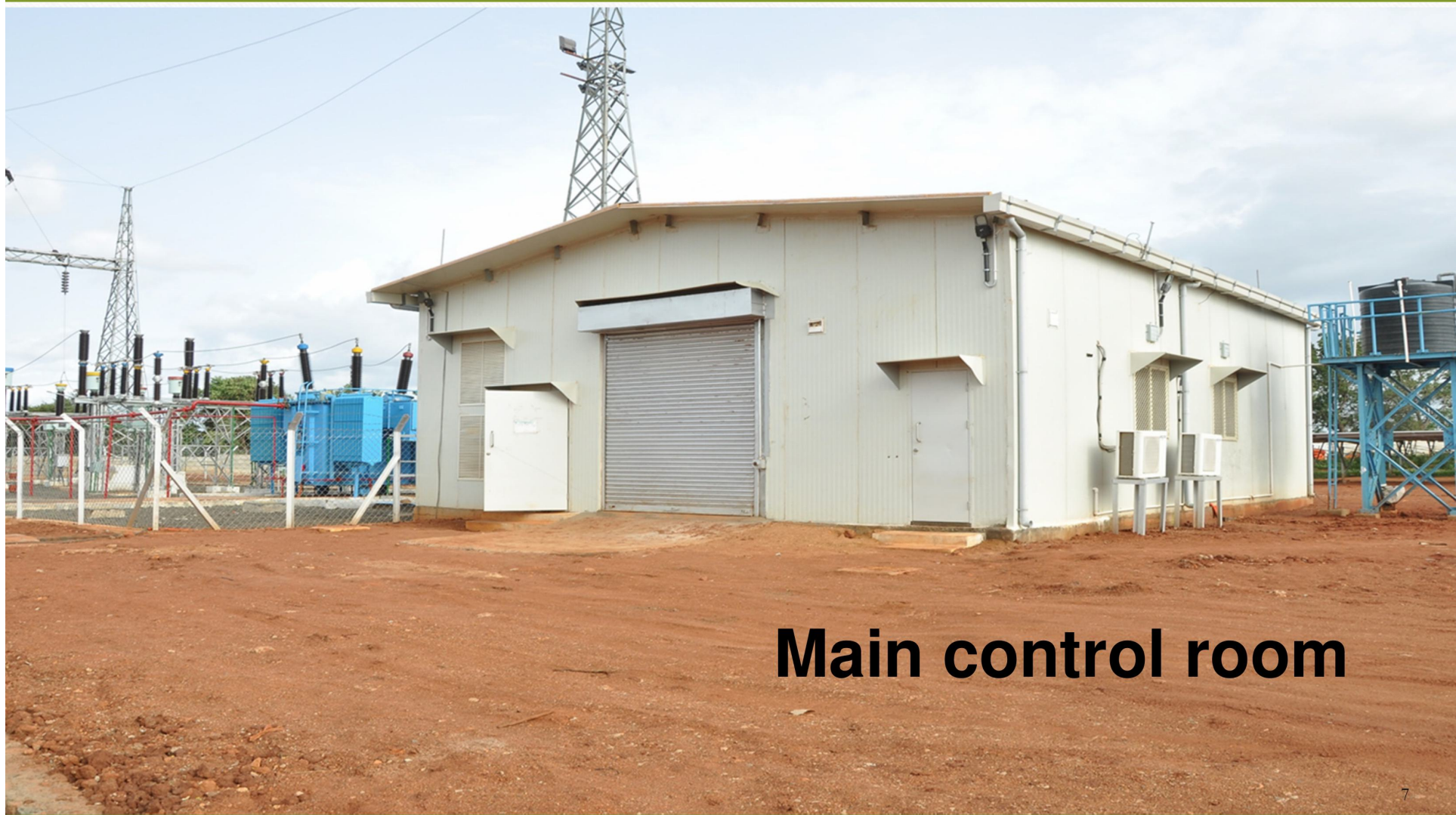
Main control room