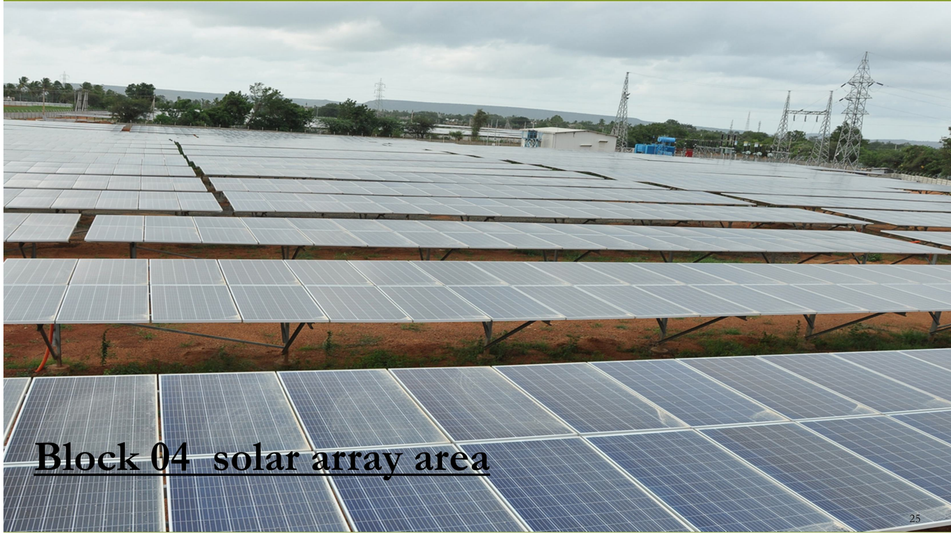
Block 04 solar array area