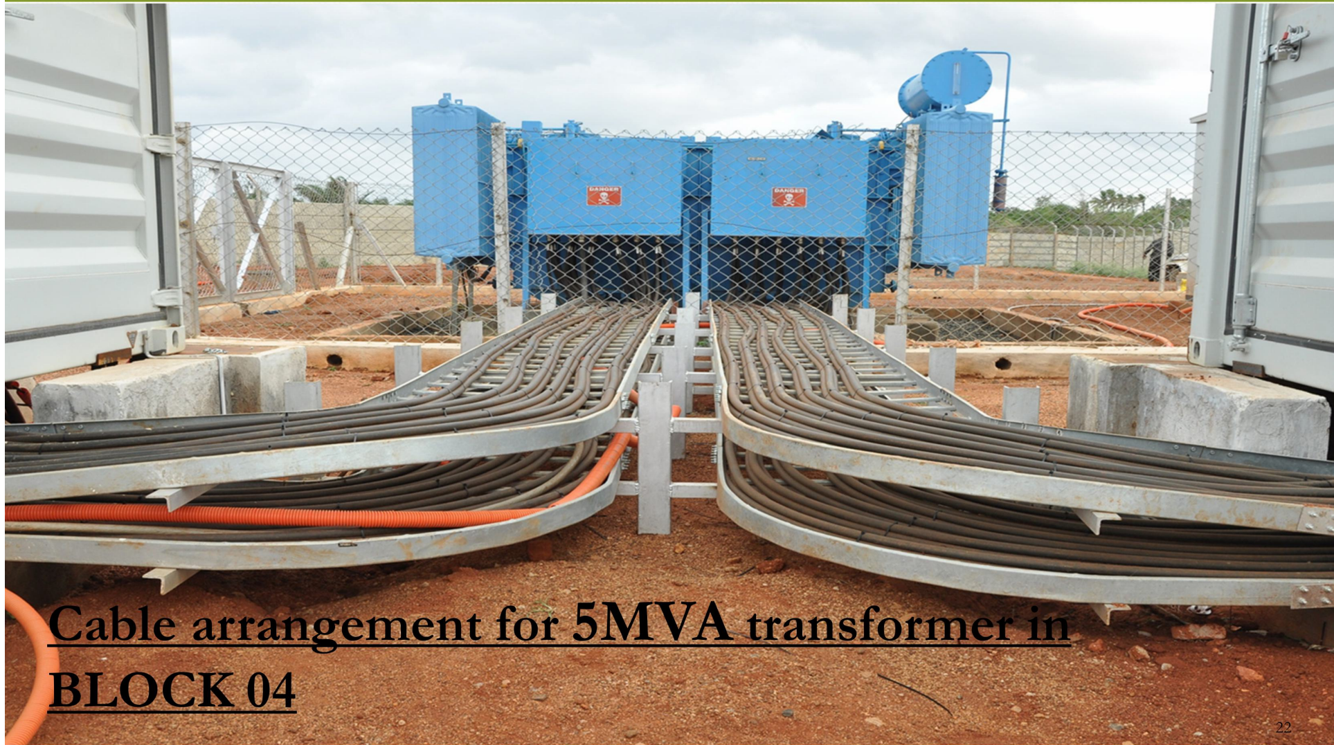
Cable arrangement for 5MVA transformer in BLOCK 04