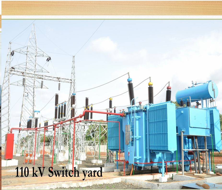
110 kV Switch yard