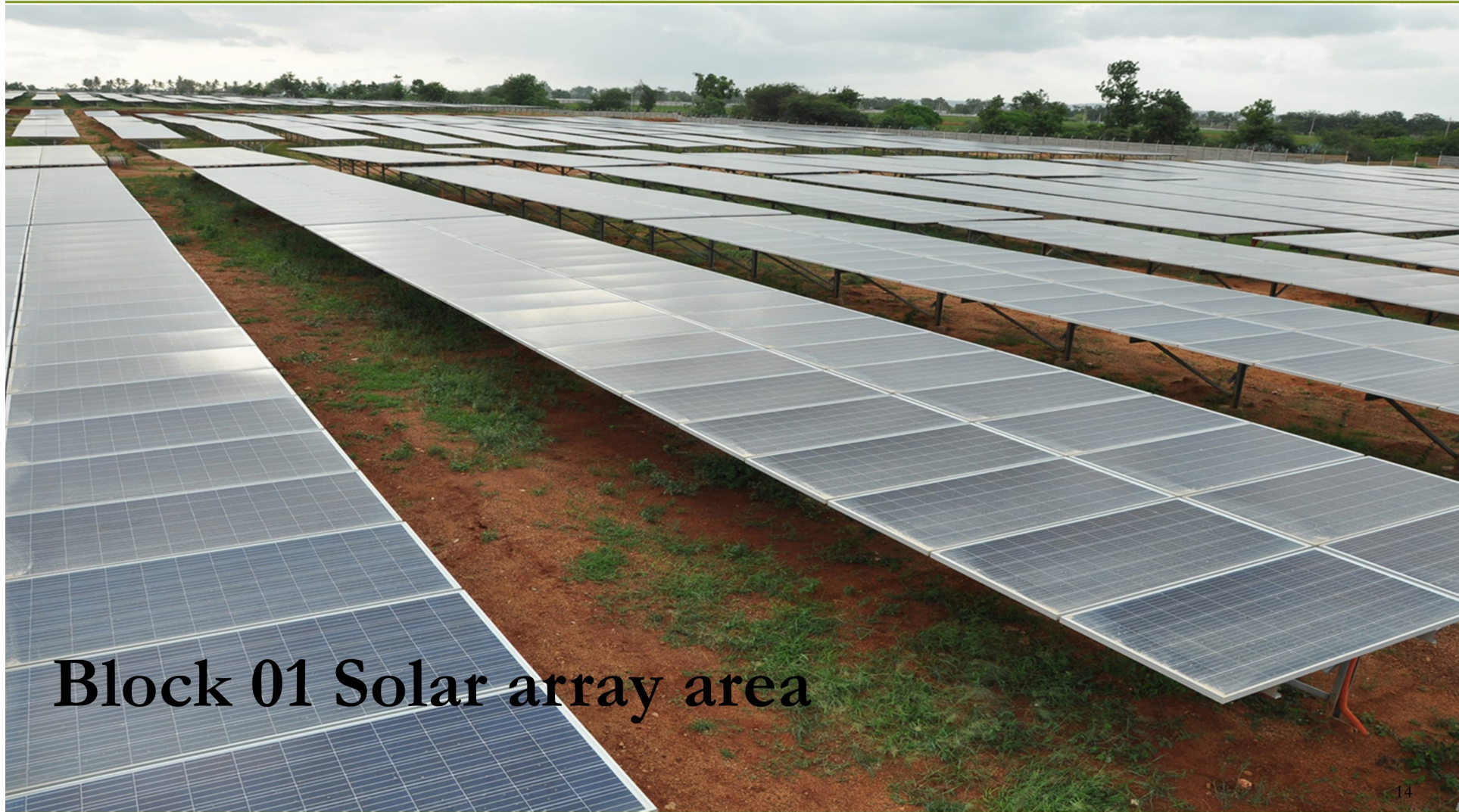
Block 01 Solar array area