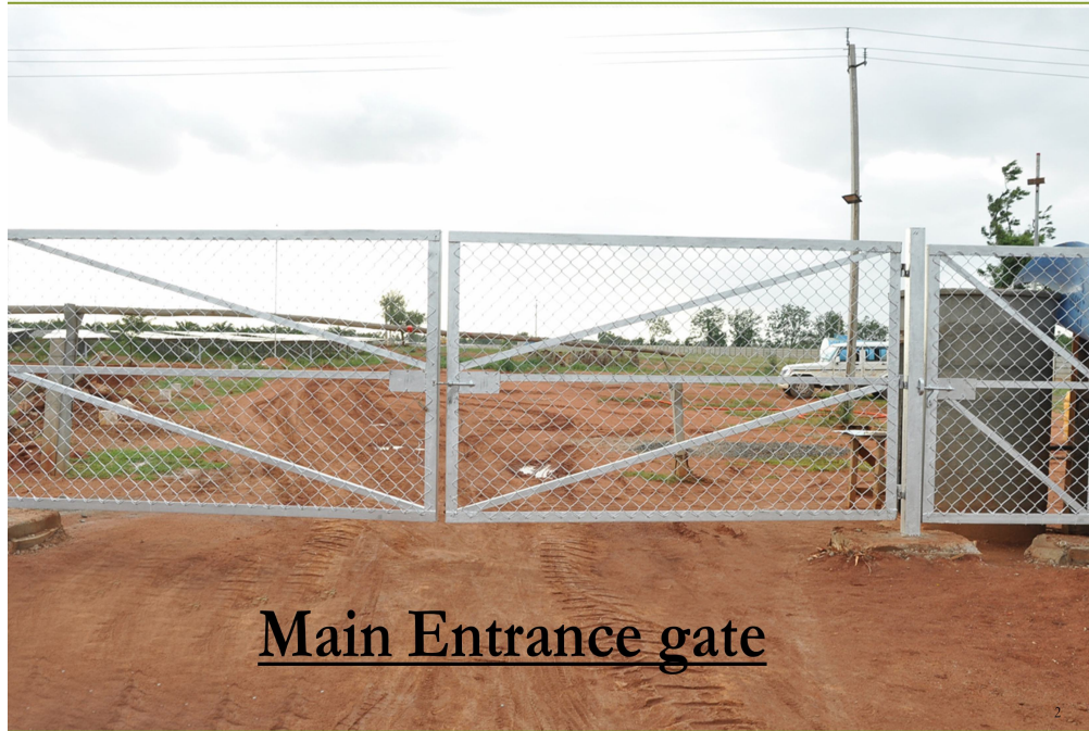
Main Entrance gate